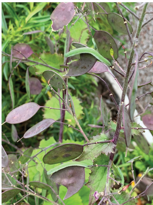
Fig. 1. Crowding of two L5 and two L4 A. cardamines larvae on the touching main two Lunaria plants (M1 and M2).

The two mauve-flowered plants, parts of which touched each other, grew in a clump (rooted in a patch of earth of around 80 cm diameter, raised about 25 cm on its south-west side from a lawn within one metre) comprising these two