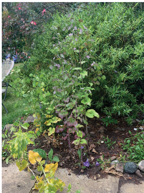
Fig. 2. The main Lunaria clump, from the north east. Photo taken on 12.vi.2020, soon after a gale had blown the largest white-flowered plants over.