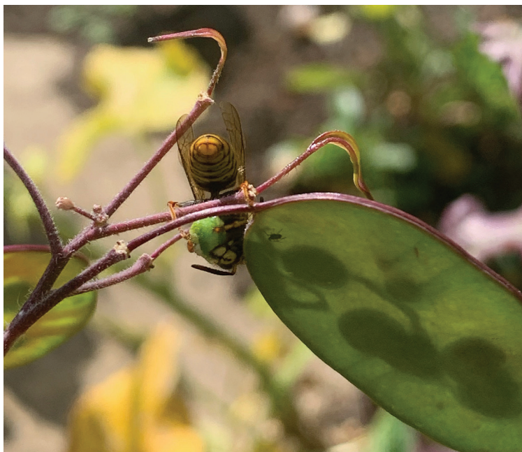
Fig. 7. Worker of Vespula vulgaris processing part of a larva of A. cardamines .

I had hoped to follow the progress of all the caterpillars through to the time that they left the plants for pupation, but on the adjacent plants M1 , M2 and W1 on 9.vi.2020, between early morning and 10.00, tragedy struck. A worker of Vespula vulgaris (Linnaeus) (Common Wasp) found the caterpillars and at 9.00 I found the M1 T/L5 mutilated and dying; within moments the wasp was back, carrying it away. Others had already been taken, and I saw the vespid, or more