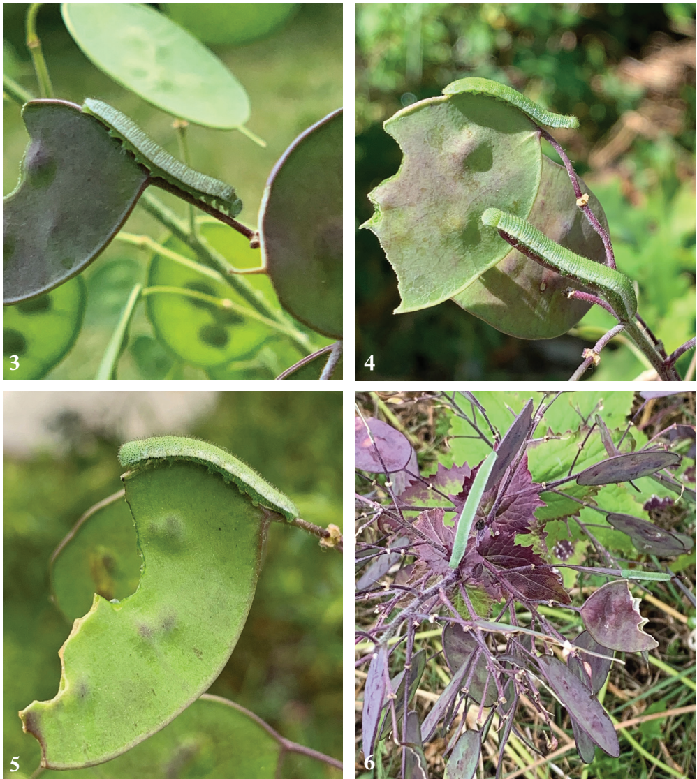
Figs 3–6. Larvae of A. cardamines on purple-flowered Lunaria ; 3, L4–L5 proecdysis; 4, L4 and L5 close together on the top of M3; 5, L4 at rest on its half-eaten pod; 6, Late and early L5 larvae, certainly not well-camouflaged.

The plants were monitored each morning and evening, and progress and positions noted. It was apparent that (under the conditions by then prevailing) growth was not rapid. The pause in feeding for ecdyses (both from L3 to L4 and from L4 to L5 (Fig. 3)) lasted for at least two days (in one L3 to L4 transition for