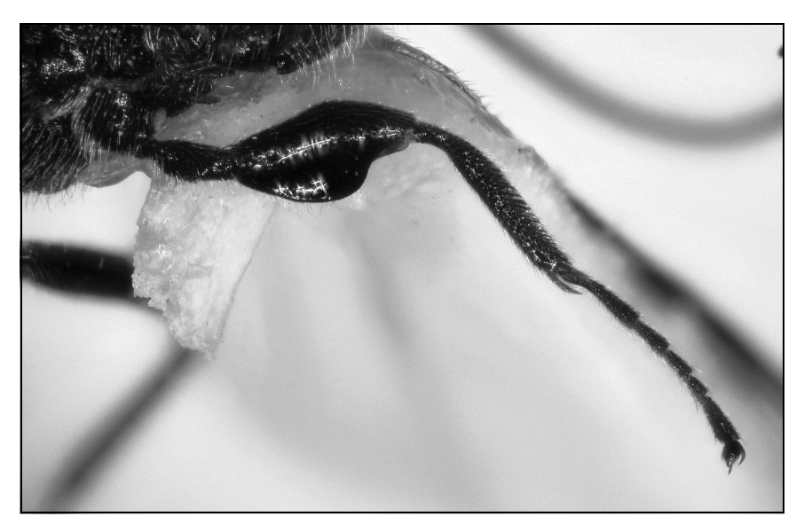
Fig. 2. Lestricus secalis, female. Fore leg.

In view of the above, it was on the one hand pleasing and on the other hand not especially surprising that L. secalis has indeed turned up in a native pinewood in Scotland. One of us (HM) reared a single female from 2–3 cm diameter sections of a recently dead branch taken from a living but moribund Pinus sylvestris in Abernethy Forest, Elgin (VC 95) on 24.v.2014 and sent it to MRS for determination. The wood was placed in an emergence trap (as figured in Mendel & Hatton, 2014) and the specimen appeared in the collecting pot sometime between 21.xi.2014 and 15.v.2015. The only beetles reared were a few Glisrochilus hortensis (Geoffroy) (Nitidulidae),