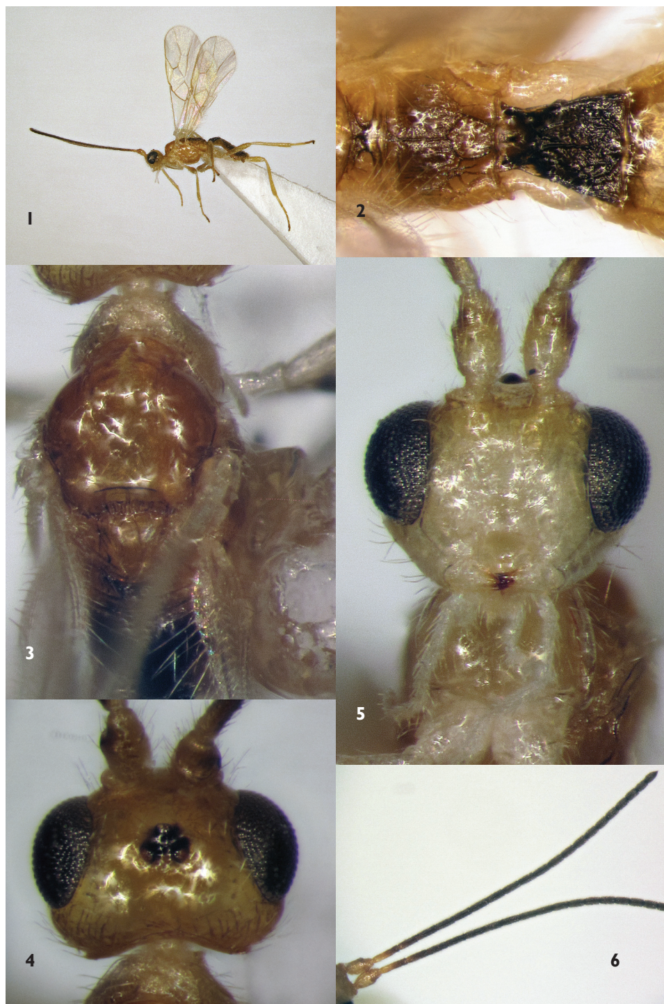
Figures 1–6. Pseudavga flavicoxa , female. 1 habitus, lateral 2 propodeum and 1 st metasomal tergite, dorsal 3 mesosoma, dorsal 4 head, dorsal 5 face 6 antennae.