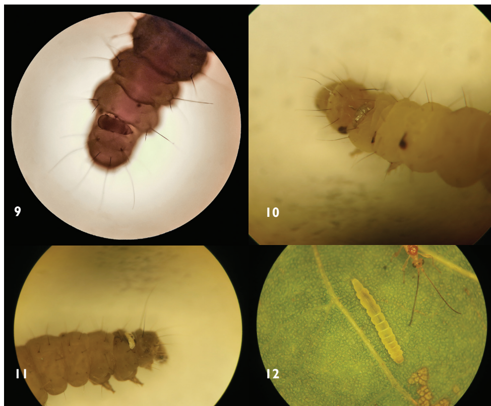
Figures 9–12. Pseudavga flavicoxa with final instar larval host Bucculatrix thoracella . 9–11 egg on intersegmental membrane behind prothorax of host 12 adult female parasitoid ignoring host.

fluid that appeared in the tube, and three adults suffering this fate were dissected (8, 9 and 12 days after 10.x.2014, when they had started to feed on dilute honey). The dissections hardly differed, each showing a single egg nearing maturity in each of the two ovarioles of the paired ovaries (i.e. 4 eggs in advanced ovigenesis, Figure 13), but with little sign that other eggs would follow. No egg had entered the oviduct per se, and it was unclear whether they were ready for oviposition or, conceivably, being resorbed. It does, however, seem certain that if eggs were going to be ready for oviposition from these females in October 2014, the period from 10.x.14 to (maximally) 25.x.2014, during which they had been warm, fed ad libitum, and given access to hosts, was long enough for them to have become so. Thus it was surprising that no ovipositions were obtained, especially as the adult female parasitoids showed no sign of behaviour suggesting that they might overwinter as adults (it has not, however, escaped notice that none of the adults of Pseudavga seen has unequivocally overwintered in a host cocoon).